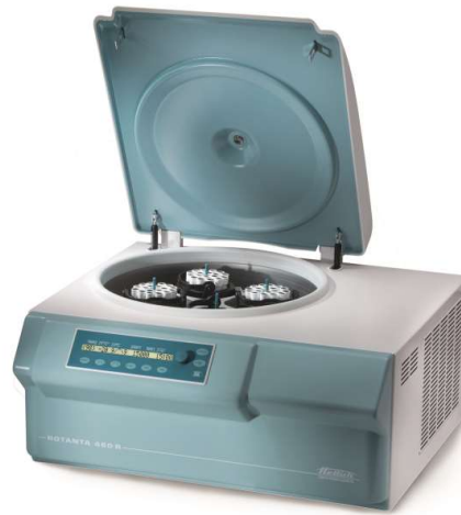
Rotanta 460R Cat.No.: 5660