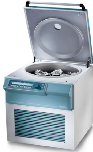
Roto Silenta 630 RS Cat.No.: 5005