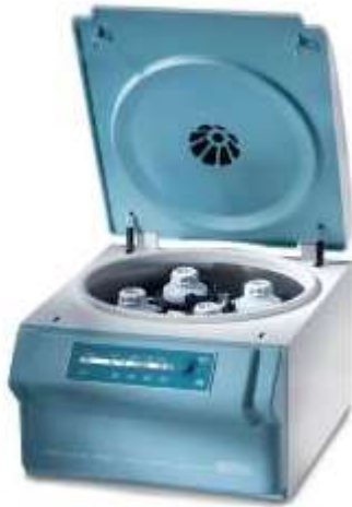
Rotanta 460 Cat.No.: 5650